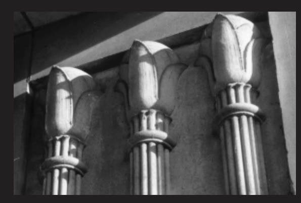
Precast concrete detail from Hope Abbey Mausoleum, built 1913-14.

Hope Abbey is once again an operating mausoleum. Crypts, niches and window memorials are now available for purchase. For more information, please contact the Eugene Masonic Cemetery at (541) 684-0949.